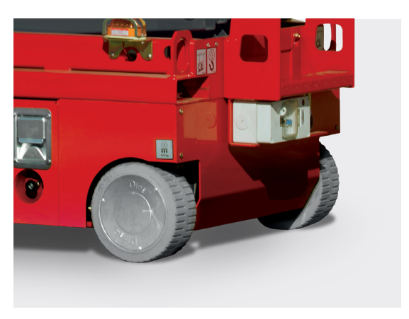
Non-marking solid tyres